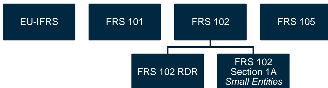
Figure B1. UK financial reporting framework requirements

B43 Companies in the UK are classified into reporting groups according to size thresholds: